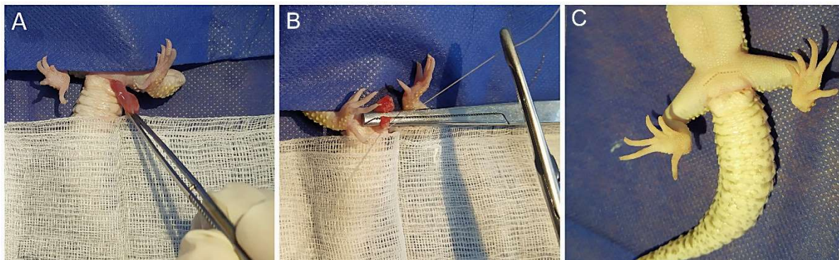
Figure 2: Hemipenectomy in a leopard gecko.

The leopard geckos and bearded dragons were placed in the dorsal recumbency position (Fig. 2-A), while the chameleons were placed in lateral recumbency. Surgical antisepsis on the cloacal area was performed using 0,2% chlorhexidine solution. Hemipenes were fixed and stretched separately. Transfixing ligature was placed at the base of the affected hemipenis (Fig. 2-B) using polydioxanone 4/0 (PDS* II®, Ethicon). The hemipenis was resected distal to the ligature point and the left stump tissue was replaced within the hemipenile sac. The same was repeated on the other hemipenis in the cases of bilateral prolapse. A single ligature could be placed under the base of both hemipenes in the bearded dragons. No need for external suturing or decreasing cloacal diameter with purse-string suture was needed after the hemipenectomy (Fig. 2-C).