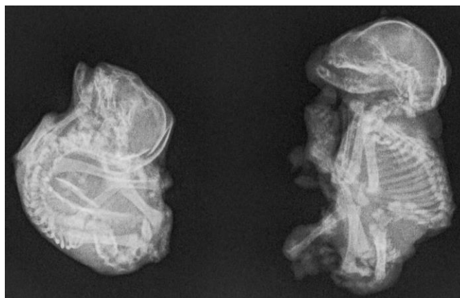
Fig. 3 X-ray examination of fetuses in second cat. The complete development of all bones could be established.

Ovariohysterectomy was performed according to the method described by Brass (1999). The uteri of cats were small, normal sized, smooth surface, pink, without trace of trauma, adhesion or cicatrices. In both animals the surgical intervention performed without complications. After 24 hours of stay at the station, the queens were released in good condition. On the twelfth day the animals were brought for a prophylactic examination in which no pathological deviations in the healing process were found.