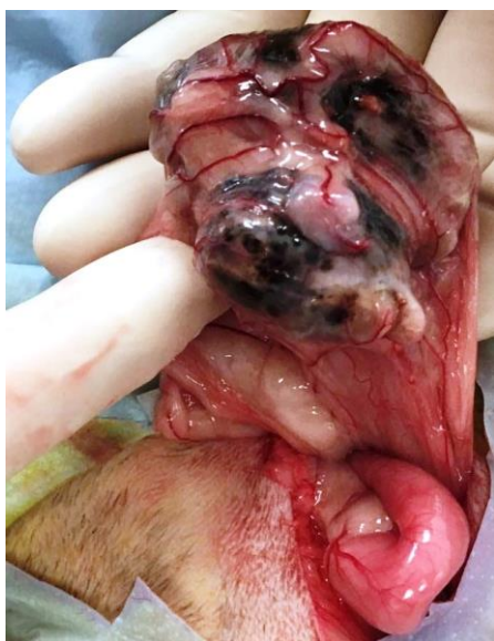
Fig. 2 Ectopic fetuses in the second cat. The fetuses were tightly surrounded by omentum